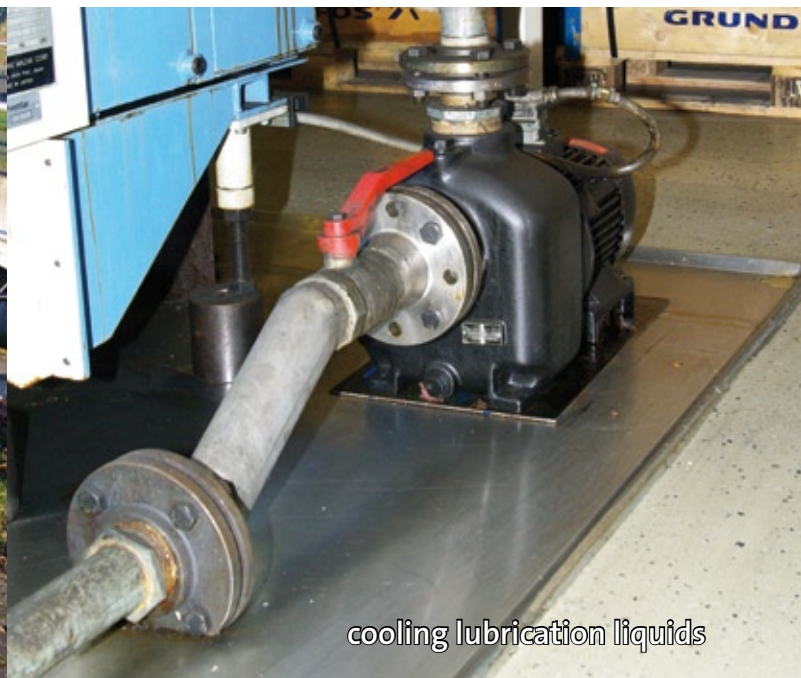
cooling lubrication liquids